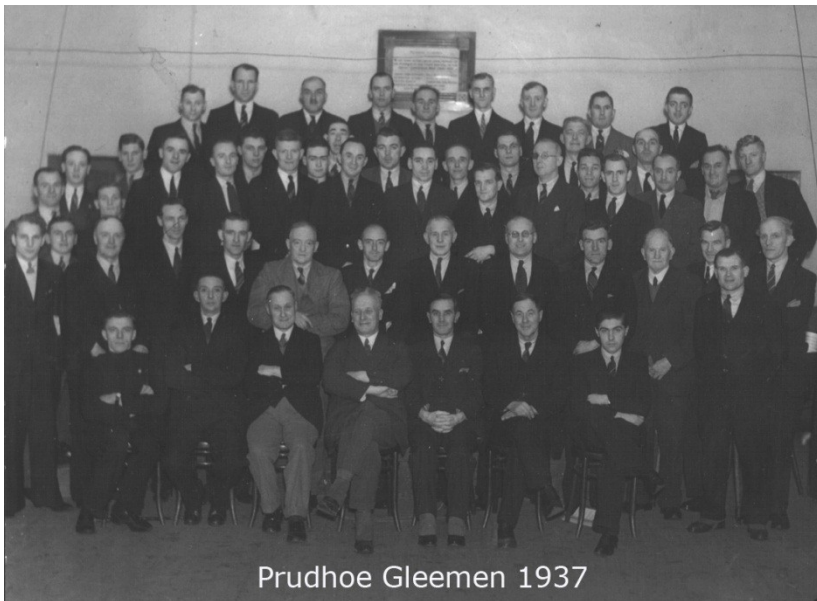
Prudhoe Gleemen 1937