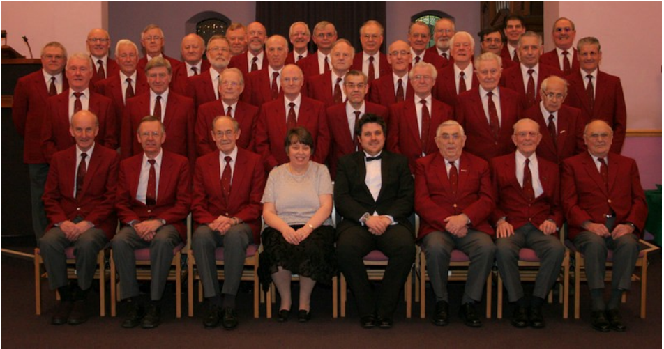
PRUDHOE GLEEMEN 2010