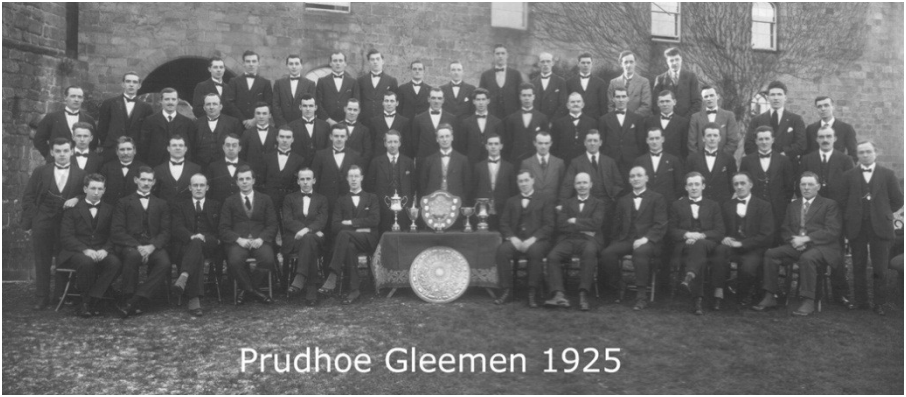
Prudhoe Gleemen 1925